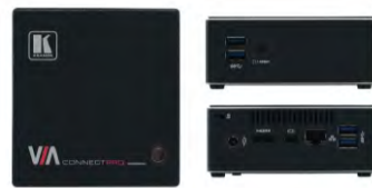
VIA CONNECT PRO