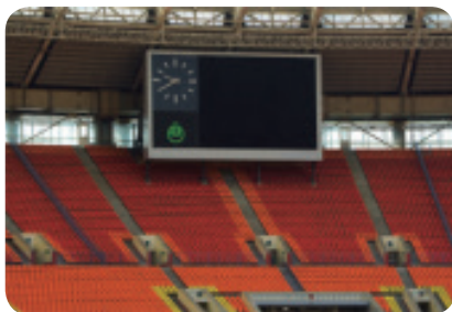
House of Worship & Event