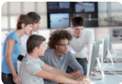
Education & Training